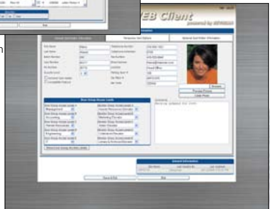
Card Holder Edit Screen