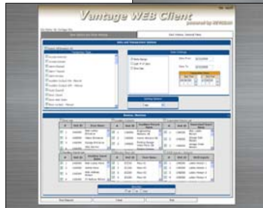
Web Report Screen